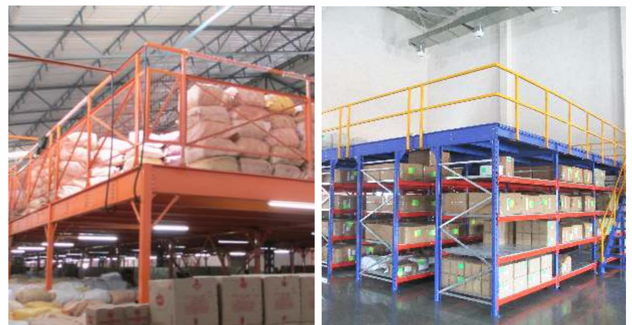
The STEELFUR TM Mezzanine floor & Multi Tier System is a compact Storage System especially designed for general storage warehouses.