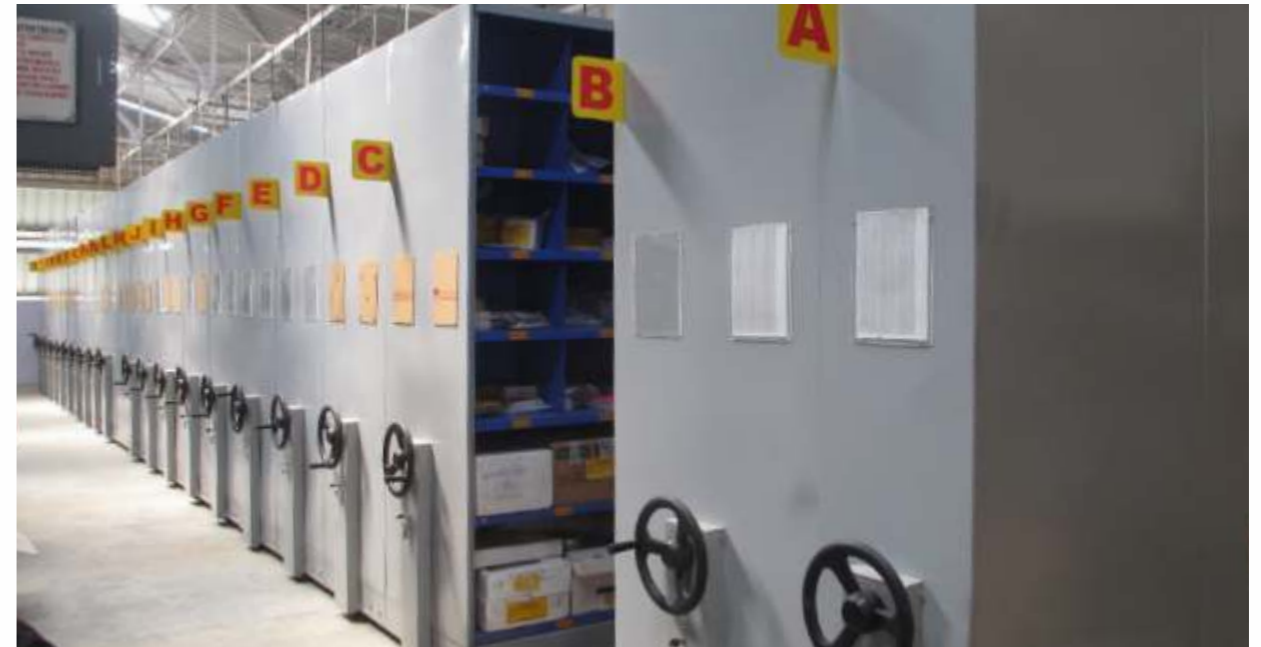
The STEELFUR TM Mobile Rack System (Compactor) is a compact Storage System especially designed for maximum space utilization and storage of documents.