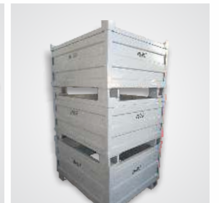
STACKABLE PALLET Size: 555(H) x 865(W) x 1050(D)

Size: 1000(W) x 800(D) x 150(H) Size: 1000(W) x 1000(D) x 150(H) Size: 1200(W) x 1000(D) x 150(H) Size: 1200(W) x 1200(D) x 150(H)