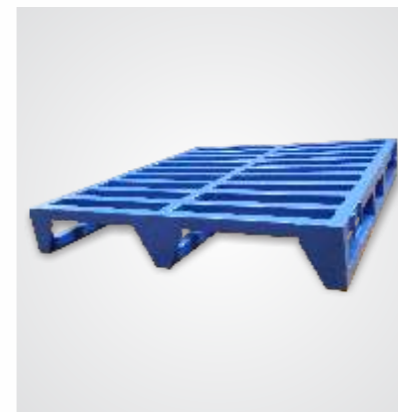
MS PALLET Two Way / Four Way 500 Kgs to 1.5 Ton

Size: 1000(W) x 800(D) x 150(H) Size: 1000(W) x 1000(D) x 150(H) Size: 1200(W) x 1000(D) x 150(H) Size: 1200(W) x 1200(D) x 150(H)