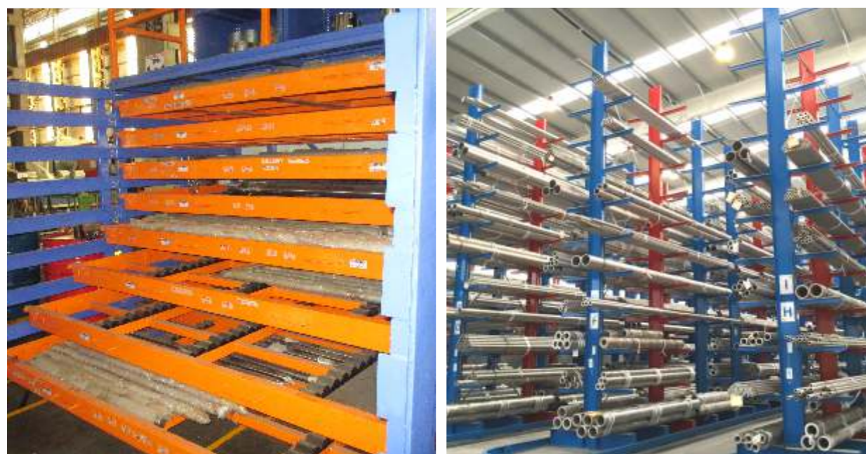
PULL OUT RACK