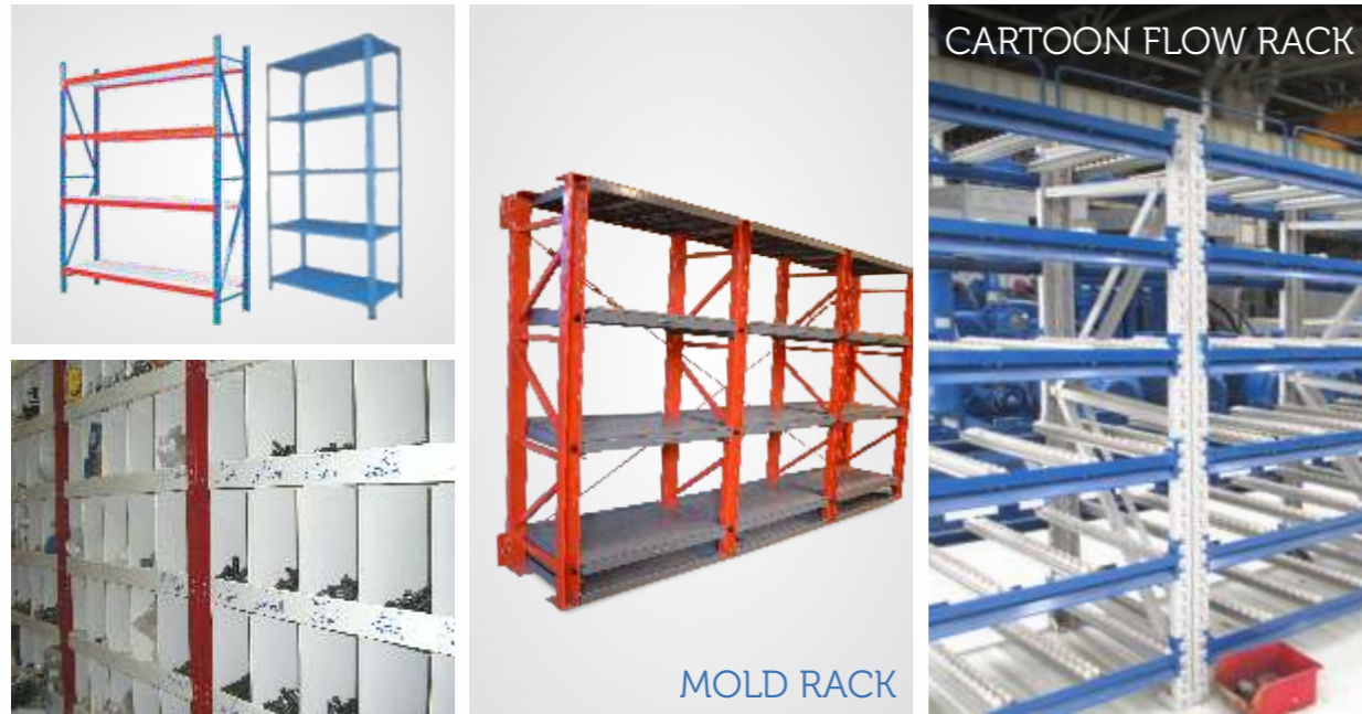
The STEELFUR TM Slotted Angle Racks & Medium Duty Racks are compact Storage System especially designed for general storage & display purpose.